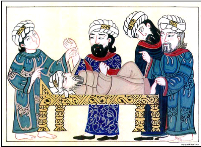
Figure 2. This miniature is a representation of a consultation among physicians [4].

and established a foundation called “Association for the Support of Contemporary Living” (Çağdaş Yaşamı Destekleme Derneği, ÇYDD). This Association provides scholarships for education of girls.